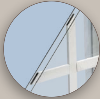
Grilles Between the Glass (GBG)