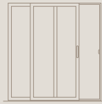
Sliding Patio Door