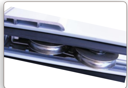
Heavy duty stainless steel tandem rollers provide smooth, effortless and long-lasting operation