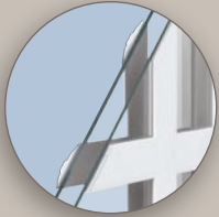
Simulated Divided Lights (SDL)