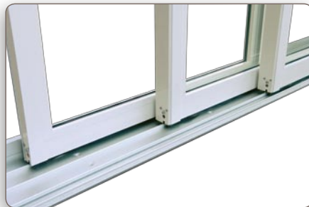
2 and 3 track systems available for multi-slide and pocket configurations

Structurally braced bottom rail supports larger glass sizes